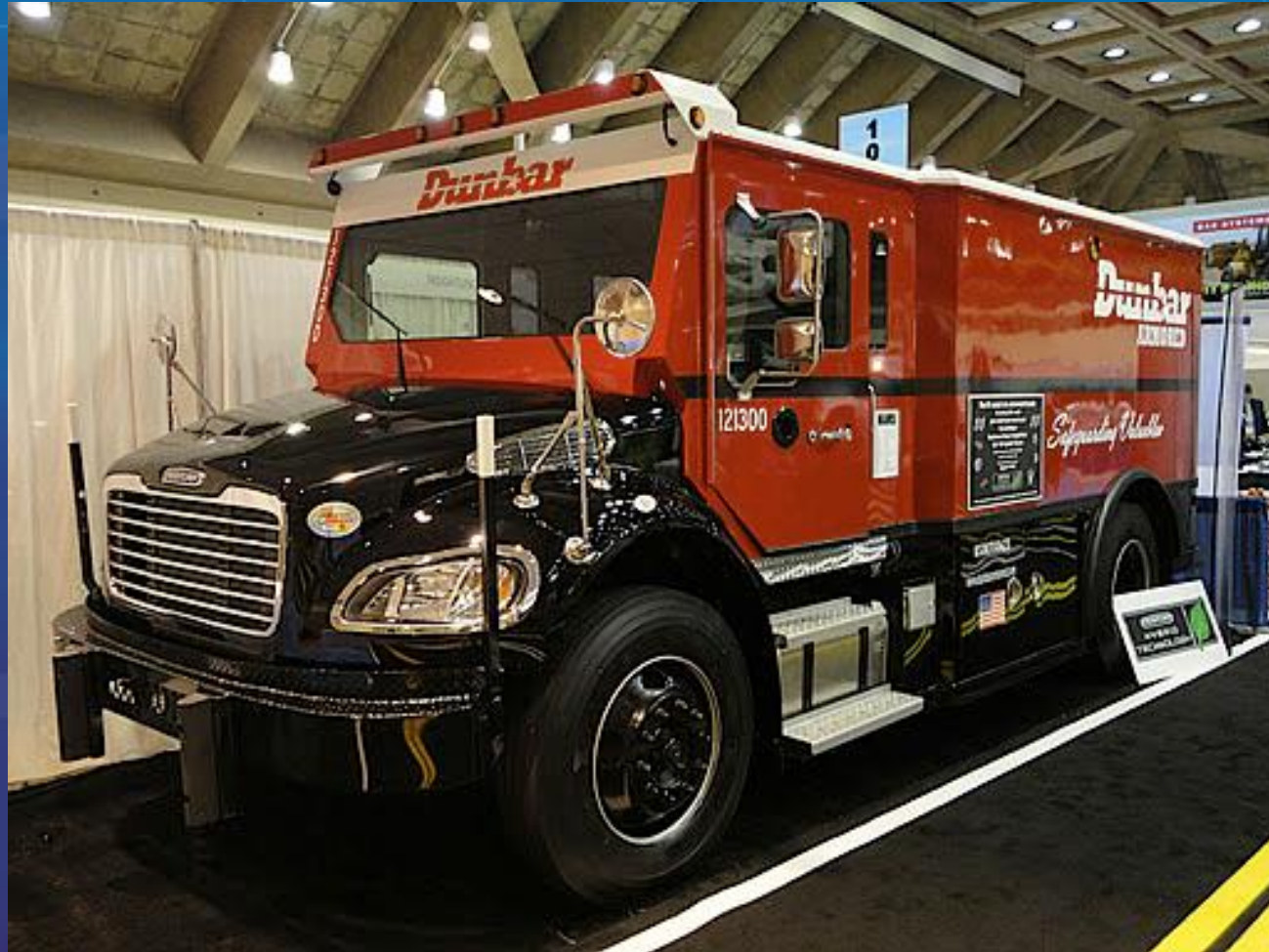
Armored Truck Built in America by Freightliner on Display at 2011 HTUF Conference in Baltimore