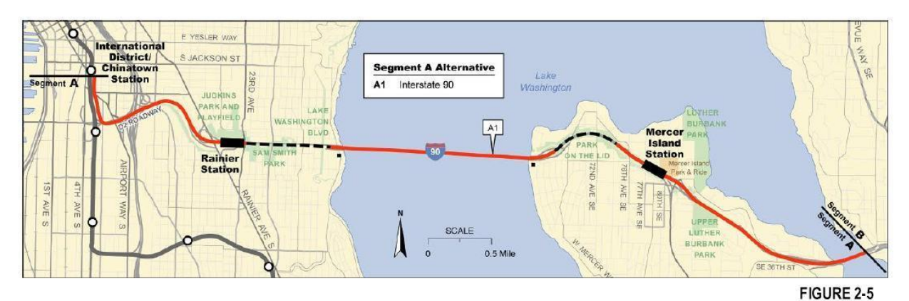
East Link Project - Segment A

WSDOT photograph of I-90 floating bridges from Seattle perspective looking toward Bellevue